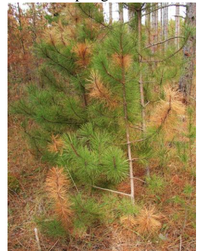
Diplodia can kill branch tips on young red pine growing under older red pine.

Diplodia and planting: Although this disease can make itself known on older red pine following hail damage or other stresses, a bigger issue is when young red pines are growing under or are planted under older red pines. Older, larger red pine trees will always have some diplodia, which can “rain down spores” onto any young red pine growing in the understory. Multiple branches and branch tips on these young pines will be killed which seriously stunts the growth or kills the young trees. For this reason, do NOT plant red pine seedlings under a red pine overstory. If you plan to salvage a red pine stand you should remove all, or nearly all, of the larger pines before you replant with red pine.