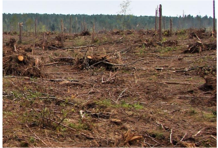
Plan enough time between salvage and replanting to avoid issues with Pales weevil.

If you have a pine stand that was salvaged and you plan to replant to pine on that site, wait! Pales weevil ( Hylobius pales ) is a native insect that infests freshly cut pine stumps. That alone is not a concern, but as new adults emerge from stumps they must do a “maturation feeding” on conifer twigs. This feeding can girdle the twig. If the only “twigs” they can find to feed on are the seedlings that you just planted, that’s where they will feed and eventually kill the seedlings, causing extensive failure of your new planting. Wait for the second springtime following your salvage/harvest before you replant. Example: you salvage your pine stand in August 2019, do not replant until the spring of 2021. Another example: you salvage your pine stand in May 2020, you should not replant conifers on that site until spring of 2022.