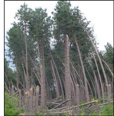
Leaning pines can have root damage as well as stem damage which makes them susceptible to bark beetle attack.

Pine salvage, bark beetles and pine sawyers: Storm-damaged pine should be salvaged as soon as possible because it will begin to stain and is very susceptible to attack by bark beetles. Native bark beetles such as red turpentine beetle ( Dendroctonus valens ) and pine engraver ( Ips pini ) will rapidly attack damaged trees that are leaning, broken or uprooted as well as fresh logs in log decks. Bark beetles will repeatedly attack storm-damaged trees, and when their populations grow, they can move on to attack healthy pine that survived the storm. For more info on bark beetles check out the WI DNR bark beetle fact sheet https://p.widencdn.net/hvn8wq/Conifer-Bark-Beetles .