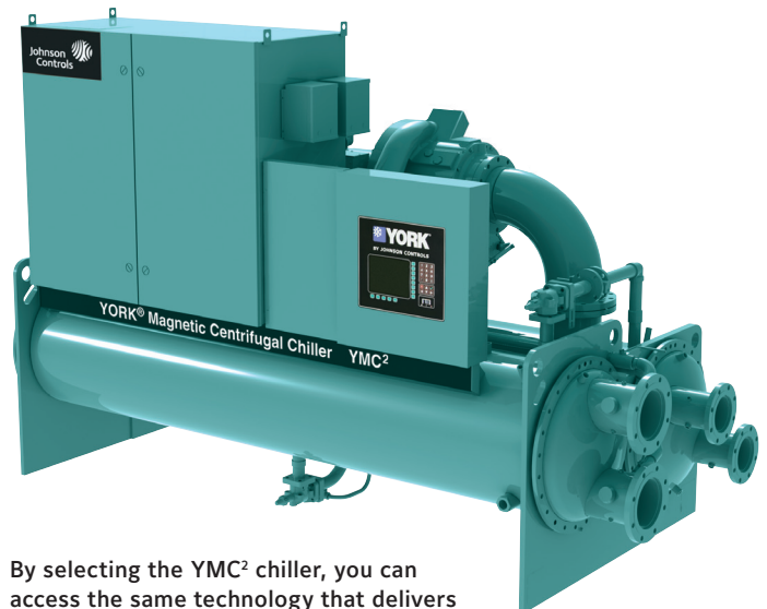
By selecting the YMC 2 chiller, you can access the same technology that delivers quiet, safe, and reliable operation demanded by navies around the world.